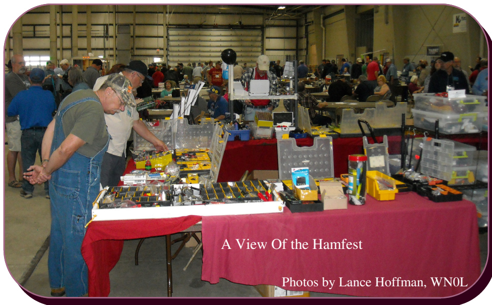
A View Of the Hamfest

Speaker Meal..... $ 8.34 TOTAL EXPENSES ... $ 8.34