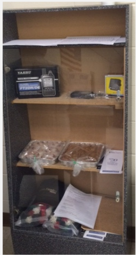
The Prize Cabinet