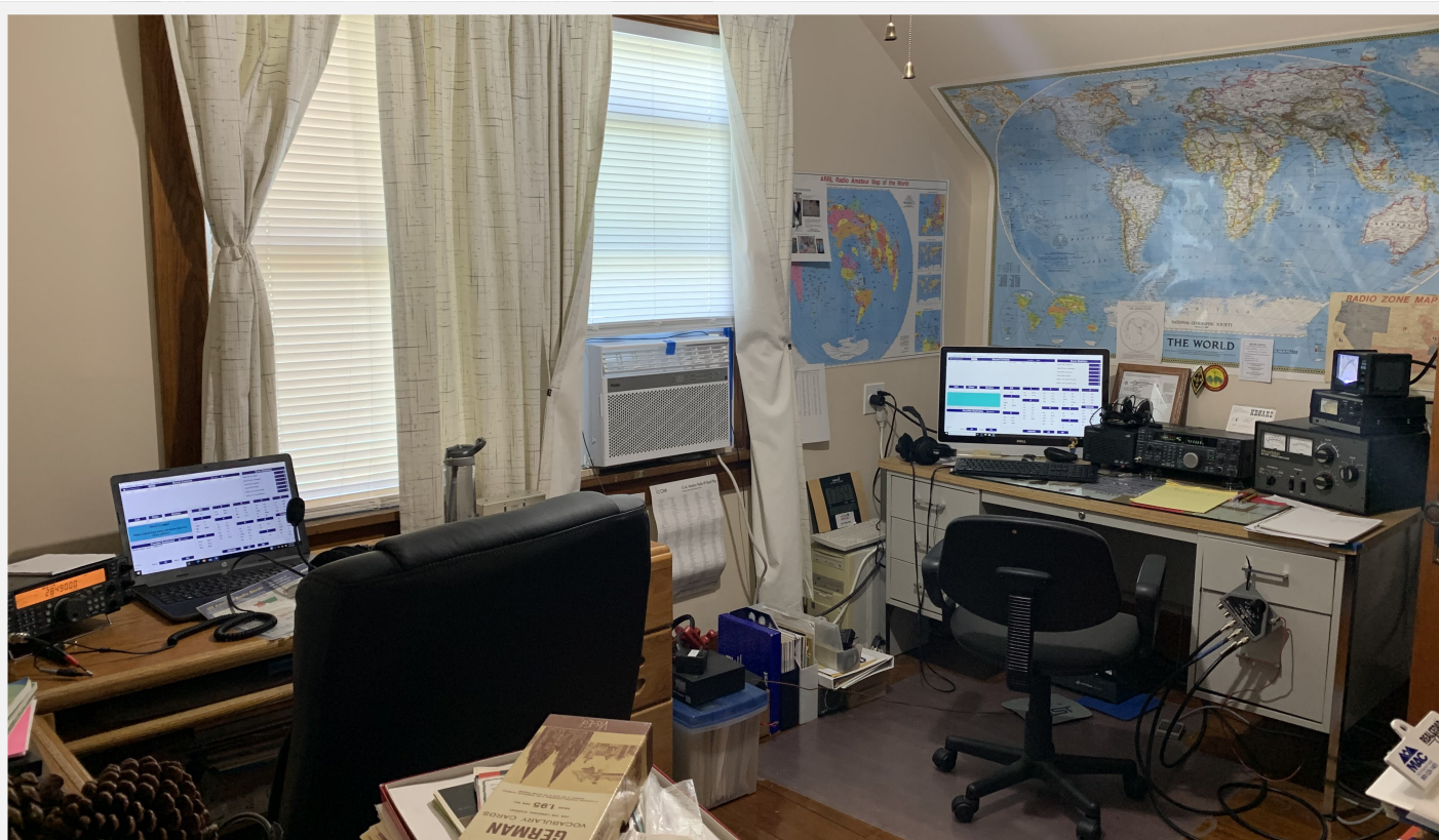
At The Mehaffey House