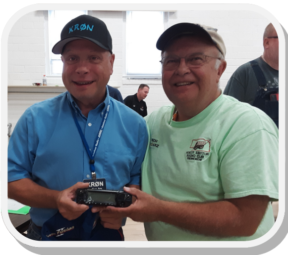
The Winner of the Radio and Rich

Both events were a success. Field Day had 340 contacts. 40, 20, 15, 10 and 6 meters were worked.