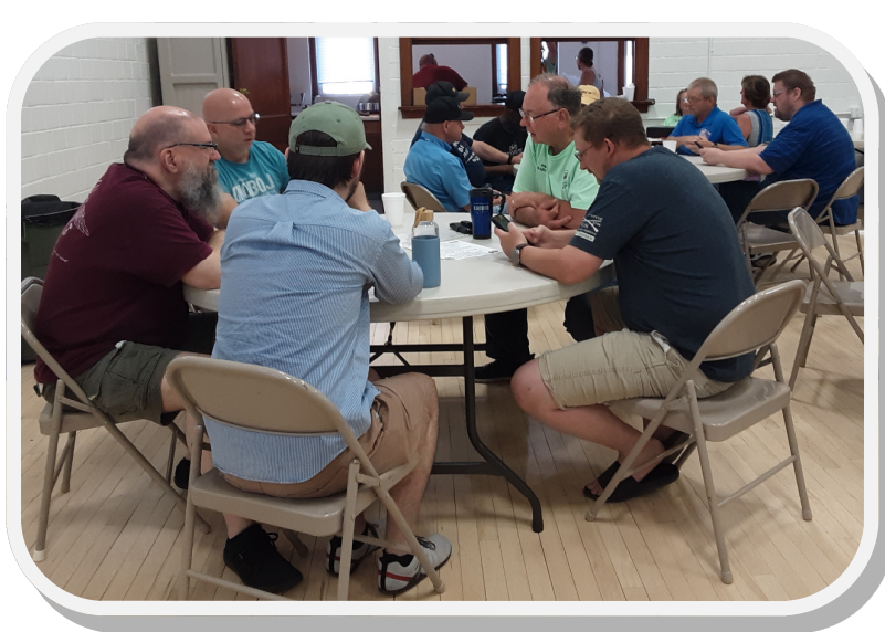
The Food Court People