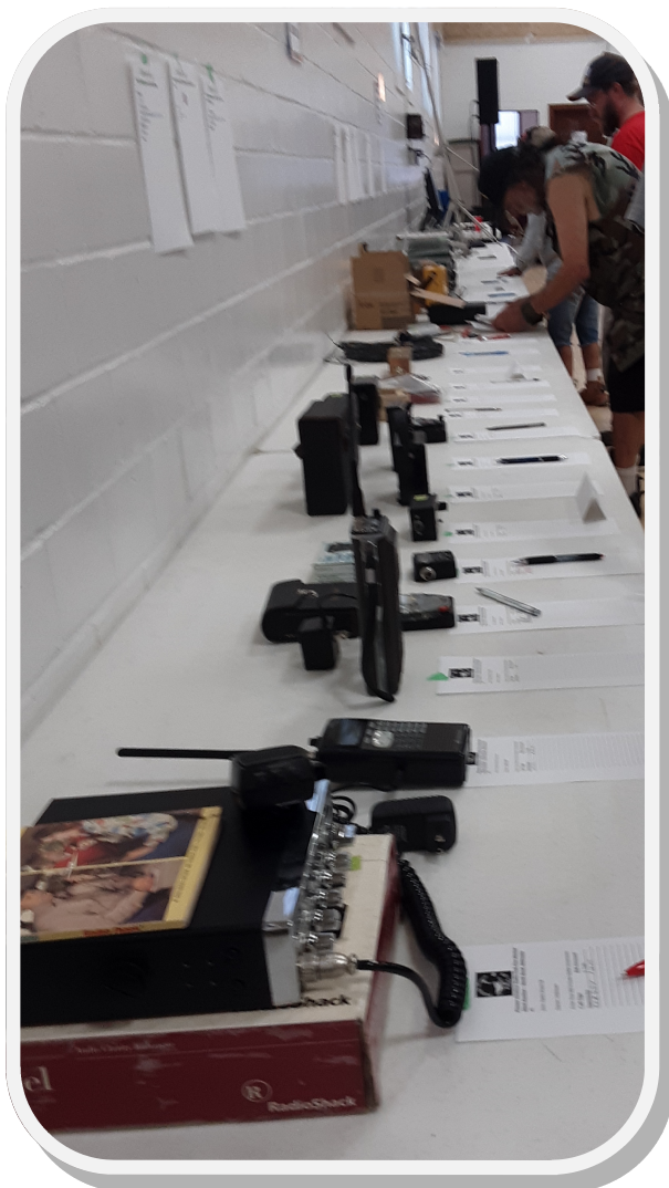
The Silent Auction